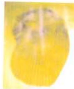
Figure 13: Lateral line scale of L.fulvus . TLS= 7.0 mm; WDS= 6.0 mm; HRS= 93; VRS= 14; RDS= 29.