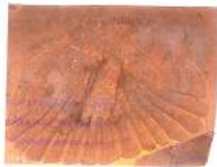
Figure 14: Lateral line pored scale of L.russellii . TLS= 6.0 mm; WDS= 7.0 mm; HRS= 77; VRS= 12; RDS= 15.

All scales of similar length did not contained same number of HRS, VRS, and RDS, i.e. in 27.5cm long female, head scale with 6.0mm length and 6.0mm wide, contained 114 HRS and 4 VRS, while the head scale with 6.0mm length and 5.0mm wide contained 68 HRS and 4 VRS. Though the size and width of head and caudal scales were small but the number of horizontal rows of ctenii on head and caudal scales were large in number as compared to the LLS and LLP scales because the size of ctenii found on head and caudal scales were small so they occupied the less space. The length of lateral line scale (LLS) and lateral line pored scale (LLP) is greater than its width, so they have no circular shape. Focus is absent on these scales. Lateral line pored scale (LLP) has canal lies along anterior and posterior axis with two opening (Esmaili et al. , 2007). Due to the presence of canal, ctenii are arranged in groups away from each other (Fig, 3&4). From the result, it is concluded that the scale studies can be