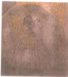
Figure 12: Head scale of L.malabaricus . TLS= 5.0 mm; WDS= 5.0 mm; HRS= 84; VRS= 15; RDS= 19.

Note that the values of correlation coefficient 'r' (r= 0.8 or 0.7) between TL and TLS; TL vs WDS; TL vs HRS; TL vs RDS for L.russellii is highly significant indicating that strong correlation is found between total body length and all above scales parameters. There is moderate or weak correlation found between numbers of ctenii arranged in vertical rows (VRS) and total body length (TL). But in L.fulvus , there is no correlation (negatively) between body length and all its scale parameters. While the remaining three species shows the moderate and weakest partial correlation. From the overall result it has been concluded that there is strong relationship found between TL vs TLS; TL vs WDS, while moderate and weak correlation found between total body length ad different scale parameters.