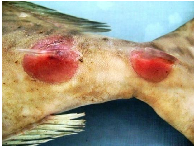
Fig. 3. Naso reticulatus : A lateral view of the caudal peduncle with keeled bony plates.

Mouth: Terminal and small, the gape slightly oblique; upper jaw length 4.8 to 5.3 in head length; teeth very small, pointed, compressed, with finally serrated edges, 64 in upper jaw and 60 in lower. Upper lip broad medially (its height \frac{1}{2} orbit diameter) and narrowing sharply to corner of mouth; lower lip thin, free only on posterior \frac{1}{2} of lower jaw. Tongue very short and broadly rounded.