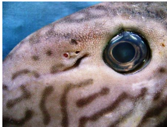
Fig. 5. Naso reticulatus : Head showing eye, nostrils and nostril notch

Colour: Body light brown dorsally, shading to whitish ventrally, the back above lateral line with numerous very small dark brown spots, forming short lines with Celtic pattern to stronger and darker reticular pattern on the body; some small dark brown spots below lateral line also forming short and wavy lines, but most markings as irregular dark brown lines; head darker brown than body except for a broad pale zone anterior and posterior to eye; cheek and side of snout below groove with a dark reticulum pattern; opercular membrane black; a large irregular dark brown blotch below and extending slightly above anterior part of pectoral fin; dorsal fin with dark brown spines and rays and nearly black membranes; anal fin with light brown rays, gray membranes that shade to blackish distally, and a pure white margin; caudal fin dark gray-brown with dark brown spots and lines, the lines paralleling the rays; pectoral fins pale gray, shading to blackish distally, with a broad dark brown bar at base; pelvic fins with white rays and gray membranes.