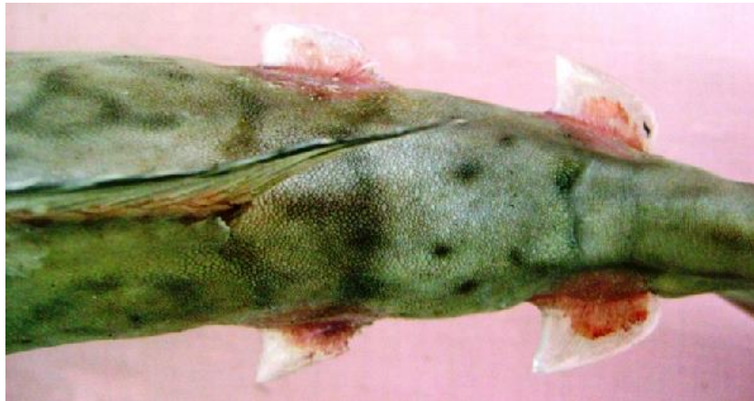
Fig. 4. Naso reticulatus : Caudal peduncle with keeled bony plates (anterior view).