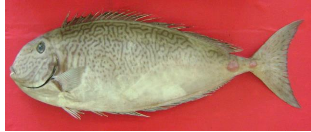
Fig. 2. Naso reticulatus collected from Karachi Fish Harbour on 14 th October 2013