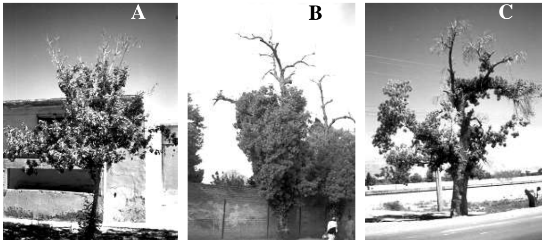
Fig. 2 (A-C): Fraxinus xanthoxyloides trees of different ages showing symptoms of dieback.