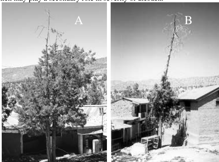
Fig. 4 (A&B): Juniper trees at Ziarat showing different stages of dieback.

Ziarat. Among abiotic factors, drought is the major one, prevailing in the region since many years. There are reports of reduction of 316 mm rainfall in through 1992 – 2001 accompanied by 2.4 °C rise in mean maximum and 0.9 °C rise in mean minimum temperature in the same period (Chaudhary and Aslam, 2005). A tree weakens by drought stress may be renders more susceptible to attack by one or more organisms or agents. Juniper trees growing in this region are known to infested by dwarf mistletoe, Arcethobium oxycedri (Zakaullah, 1977; Atta et al. , 2002; Chaudhary and Aslam, 2005). This pathogenic parasite caused reduction in vigour and growth, poor seed development, malformation of woody tissues, top drying and predisposition to insect pests and other diseases. Trees affected by this parasite are under more water stress than healthy ones (Zakaullah and Badsha, 1977). The fungus P. demidoffii , causing heart rot in junipers, may be the cause of dieback (Khan, 1989; Chaudhary and Aslam, 2005). It enters through branches attacked by or killed by the attack of dwarf mistletoe, dead branch stubs and root connections. Root disturbance and soil moisture fluctuations play an important role in the prevalence of this disease (Zakaulla, 1979). Junipers are also known to be infested with by different kinds of stem and fruit borers (Chaudhry and Rehman, 1979) which may play a secondary role in severity of dieback.