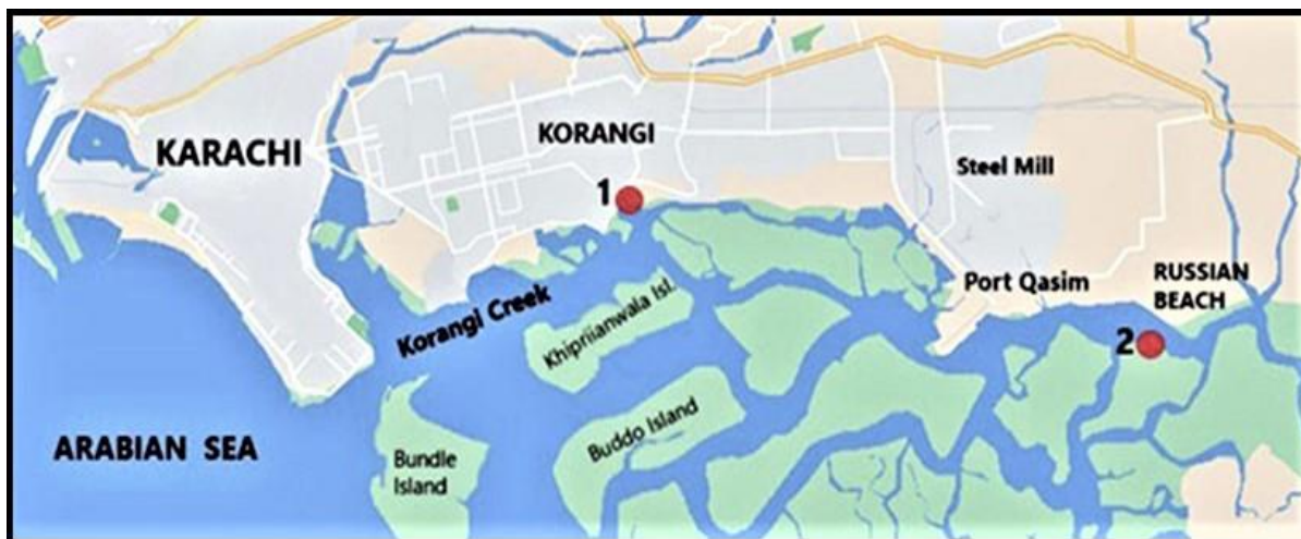
Fig. 1. Map of Karachi coastal area showing collection sites: 1, Korangi Creek and 2, Russian beach in the North Western part of the Indus Delta.

(1998), Weil et al. (1999), Robba et al. (2007), Ghosh and Mukhopadhyay (2015), and Ghosh et al. (2017). Photographs of the shells were taken by Olympus camera fitted with close-up lens. Measurements were taken to the nearest 0.01 mm by micrometer fitted in a compound microscope (Olympus CX21). All the specimens are housed in Centre of Excellence in Marine Biology, University of Karachi, Karachi-75270, Pakistan.