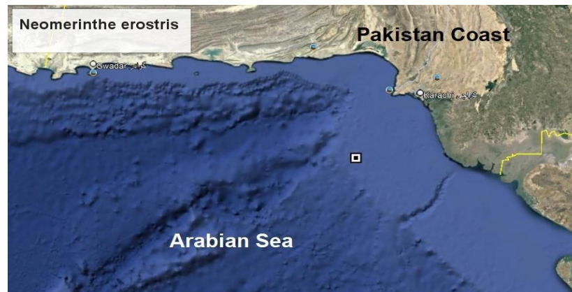
Fig. 1. Pakistan coast showing collection site of Neomerinthe erostris .

The specimen of round scorpion was trawled from offshore waters caught at a depth of 130 m southwest of Karachi, Arabian Sea on 22 January 2022 (Fig.1) using high opening bottom trawl net that has a cod end of mesh size 25 mm. Sample was photographed and preserved in 10 % alcohol.